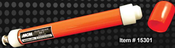
Item # 15301

Ceramic plug has a flat surface with beveled edge for general purpose use on soil surfaces. Fits through 1 inch diameter holes in pavement & asphalt, for example. Approx. overall size: 1" dia. X 8 1/2" long. Dry weight: 5 oz.