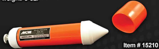
Item # 15210

Ceramic plug has conical shape designed for use in soft soil conditions. Approx. overall size 1 3/8" dia. X 6 3/4" long. Dry weight: 5 oz.