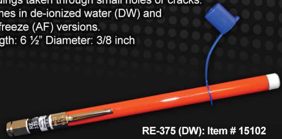
RE-375 (DW): Item # 15102 RE-375 (AF): Item # 15104

Small diameter electrode (non-extendable) designed for readings taken through small holes or cracks. Comes in de-ionized water (DW) and antifreeze (AF) versions. Length: 6 1/2" Diameter: 3/8 inch