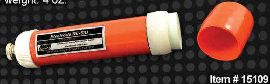
Item # 15109

Ceramic plug is uniquely designed to permit the electrode to be used in any orientation, including an upside down configuration. Approx. overall size 1 3/8" dia. X 6" long. Dry weight: 4 oz.