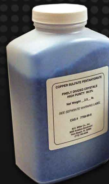
Cat. No. 17003

Finely divided high-purity crystals. Available in ¼ lb and 2 ½ lbs containers. Under normal conditions a ¼ lb container will be sufficient to maintain one electrode for a year.