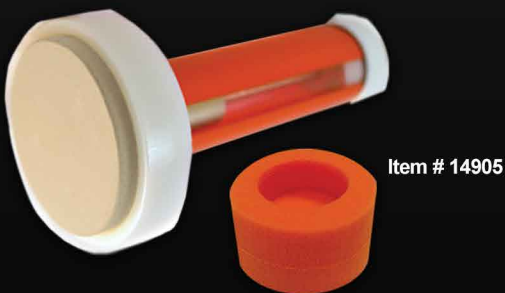
Item # 14905

Highly durable, large area ceramic plug (2.25" diameter). Electrode can be used in any orientation, including upside down configuration. Ideal for concrete corrosion potential mapping (bridge decks, parking garages, etc.) - stands upright by itself. Electrode supplied with highly absorbent sponge cap for enhanced electrical contact to concrete surfaces.