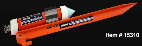
Item # 15310

Allows readings to be taken without the technician having to hold onto a reference electrode. Includes a RE-5C electrode (Item # 15210). Highly durable plastic stake with stainless steel clip. Length: 15" Width: 1 3/4" Depth: 3 1/2"