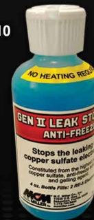
Cat. No. 18010