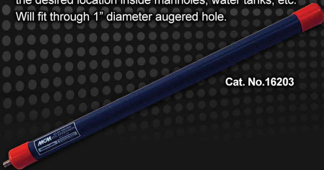
Cat. No. 16203

Intermediate electrode extension: 30" long. One or more can be used with MCM model IA and LC series meters or between the electrode and the standard electrode extension, so that the electrode can be easily placed at the desired location inside manholes, water tanks, etc. Will fit through 1" diameter augered hole.