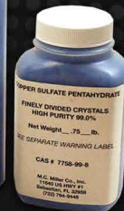
Cat. No. 16906