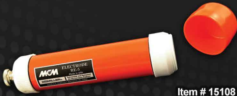
Item # 15108

Flat surface ceramic plug for general use on soil surfaces. Approx. overall size 1 3/8" dia. X 6" long. Dry weight: 4 oz.