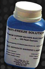
Cat. No. 17105