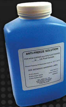
Cat. No. 17207

For use with any MCM electrode. Permits potential measurements with temperature as low as -10°F (-23°C) without danger of cracking electrode tube. Available in 8 oz. and 32 oz. (fl.) containers. Can be used year around.